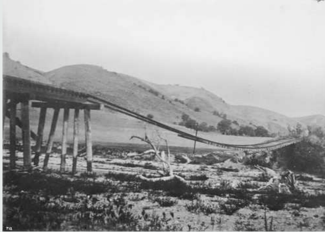
Stone Canyon Mine railway bridge - 1919

There was once a small town here called Valleton. It was located near the Stone Canyon and Pacific(?) Railway. There was a post office in Valleton from 1887 to 1918.