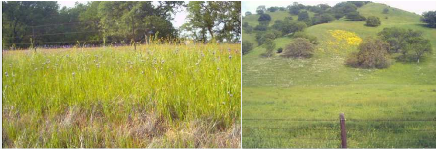
Fiddlenecks blooming alongside the road & Goldfields on the hillside