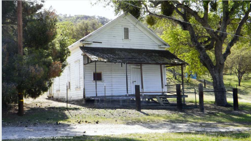
Possibly an old schoolhouse?

No, you didn't take a wrong turn and end up in the Himalayas...there are some yaks along the road here. They've been here for a number of years and seem to be dealing with the low altitude just fine.