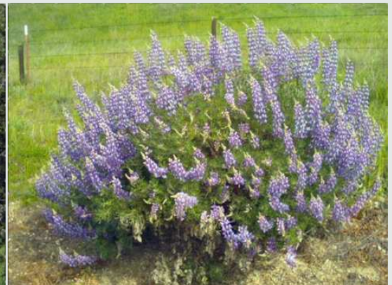
Bush Lupines blooming in a creek bed and a closeup along the road