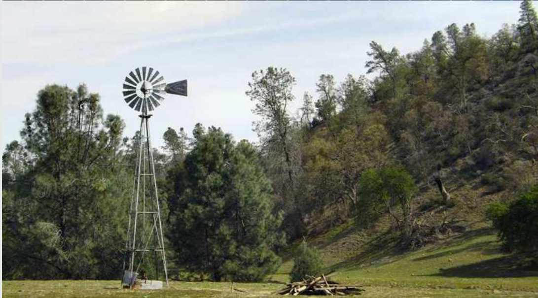
Windmill – water pump

Indian Valley Road runs north-south from San Miguel to Peach Tree Road (which continues north to CA-198). This is a beautiful back road drive through cattle country. It's a quiet and peaceful drive of about 25 miles.